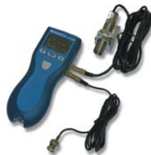
PLT200 shown with optical sensor and output cable