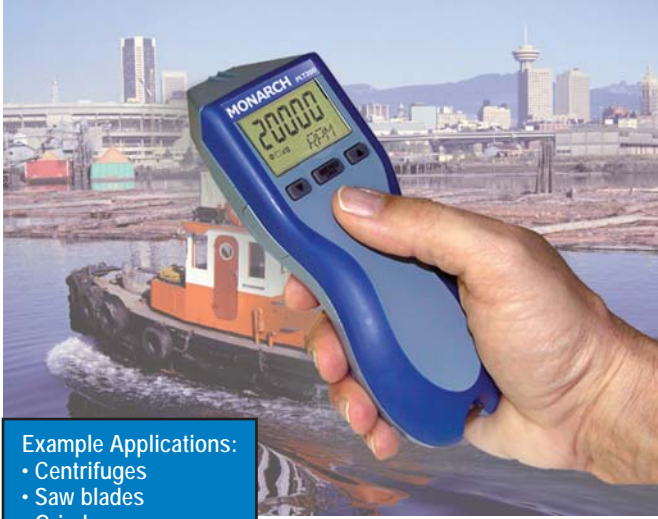
Pocket Laser Tach 200