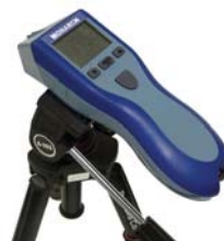
PLT200 and PT99 have a 1/4 20 threaded bushing for tripod mounting

The rugged and versatile Pocket Laser Tach is ideally suited for non-contact, contact and linear speed measurements.