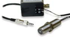
Remote Magnetic Sensor (MT-190-P) Gap 0.25 inches