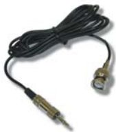
Pulse Input/Output Cable Input/output cable with BNC connector