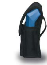
Protective Carry Pouch with belt loop (optional)