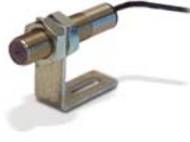
Remote Infrared Sensor (IRS-P) Gap 0.50 inches

Remote Contact Assembly (RCA) with 6 foot (1.82m) cable, Contact Tips and 10 cm Linear Contact Wheel (Shows optional 12 inch circumference Linear Contact Wheel)